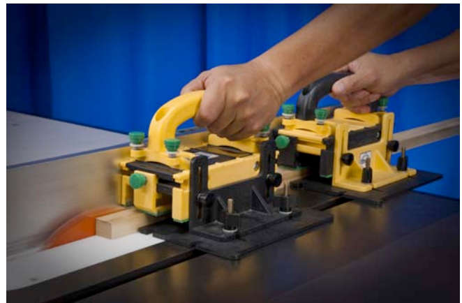
Use two GRR-Rippers for longer stock!

The two most violent injuries (kickback & losing fingers) in woodworking are finally solved with this one tool. Use it on the table saw, router table, shaper, jointer, and band saw for simply safer cuts.