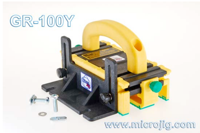
Basic GRR-Ripper (GR-100) w/GR-DVD1 MSRP: $59.95

Save your fingers and virtually eliminate kickback | Surgically precise and safe cutting