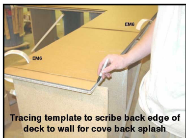
Tracing template to scribe back edge of deck to wall for cove back splash