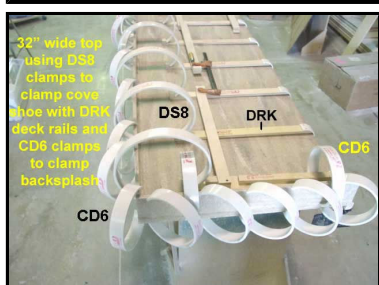
32" wide top using DS8 clamps to clamp cove shoe with DRK deck rails and CD6 clamps to clamp backsplash