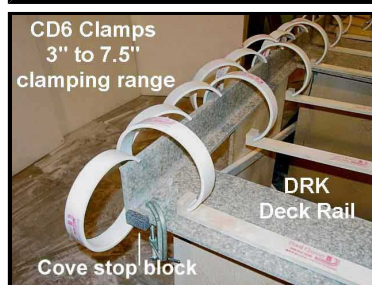
Cove stop block