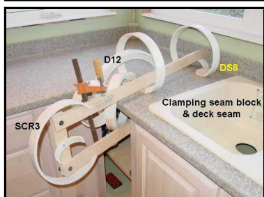
Clamping seam block & deck seam