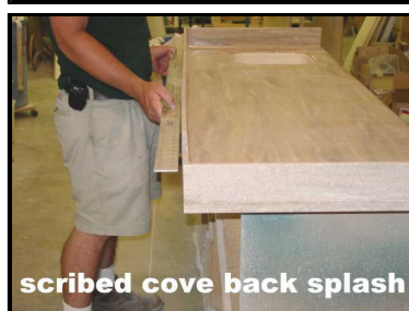
scribed cove back splash