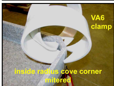
inside radius cove corner mitered