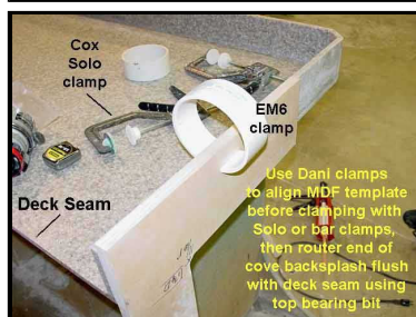
Use Dani clamps to align MDF template before clamping with Solo or bar clamps, then router end of cove backsplash flush with deck seam using top bearing bit