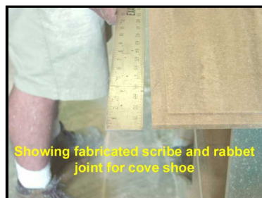
Showing fabricated scribe and rabbet joint for cove shoe