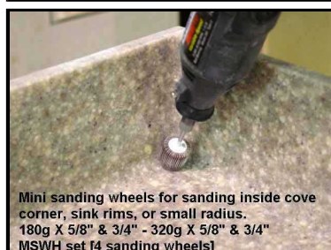
Mini sanding wheels for sanding inside cove corner, sink rims, or small radius. 180g X 5/8" & 3/4" - 320g X 5/8" & 3/4" MSWH set [4 sanding wheels]