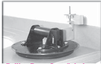
Pulling Down Low Splashes