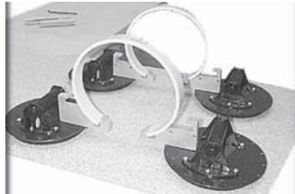
Seams with Dani Clamps

These Grips are really the Ultimate Solid Surface Fabrication grips. They feature an 8" Suction pad with a 1/8" steel plate attached. The plate has 1/4" holes around the edge every 22.5°. The accessories bolt to the plate assuring a stable production platform. The Multi-function bracket (the odd shaped one) can be used in three positions for holding straight edges, squaring back splashes and more. It has 1/4-20 threaded holes and thru-holes in numerous locations. The metal lock down ring is also threaded 1/4-20 to accept store bought rod. You can attach any length rod and screw the ring down from the top to lock down just about anything. Just look at the pictures below. These are just a few applications these grips are great for. Let your imagination go to work. I'm sure you'll look at them and see a few jobs you could have used them on.