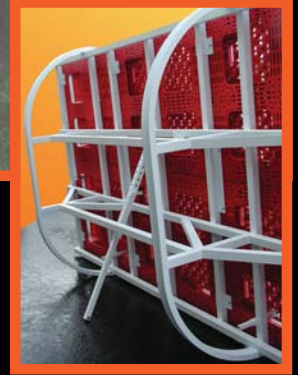
Rocker Table Back

The Slab Rocker Table designed to allow one person to handle a stone slab from A-Frame to work surface. The table can be rolled to a semi vertical position to accept the slab and is then easily lowered to horizontal for layout and cutting.