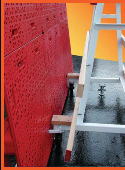
A-Frame with Brake