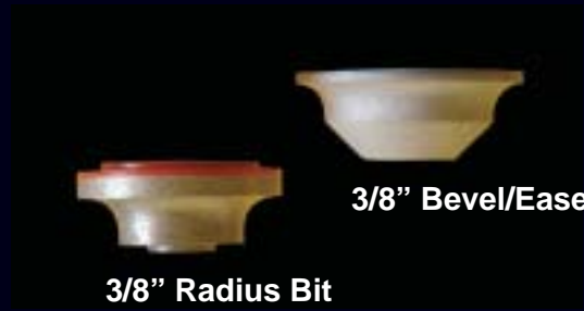
3/8" Radius Bit